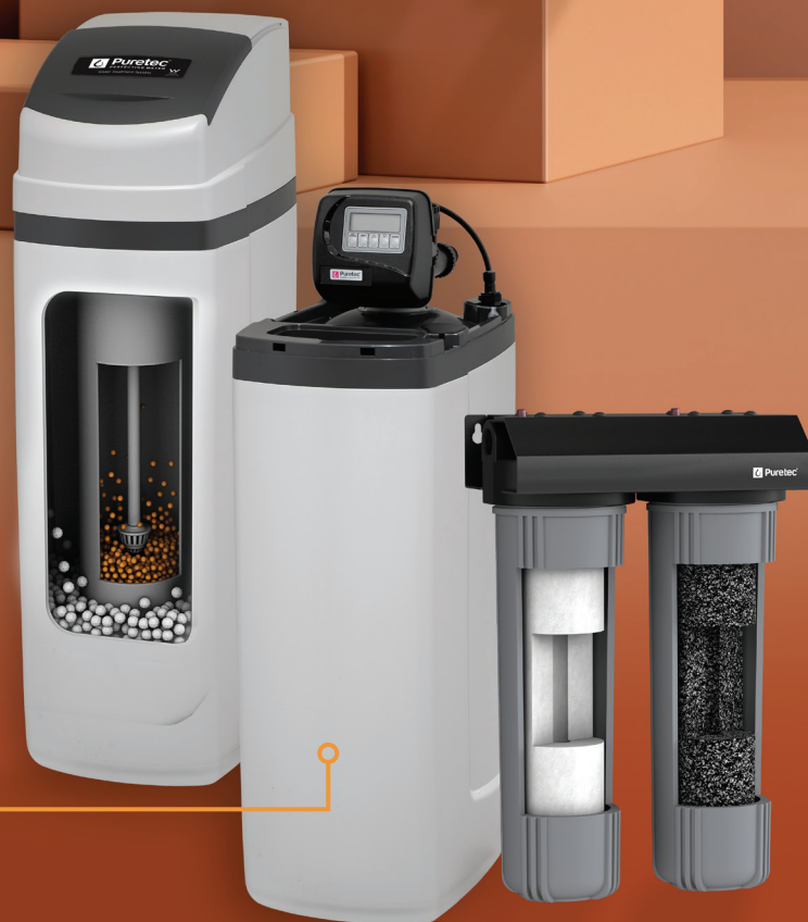
SOL40-E3 & WH2-55 Water Softener & Whole House Water Filter Bundle $4,590 +GST Supply & Install*

Available at Coppertop | Geoff 021 2491395 | www.coppertop.co.nz